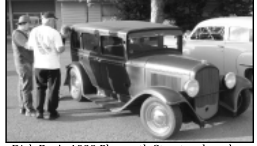
Dick Raz's 1932 Plymouth Street rod made a good impression on the CPPC members.