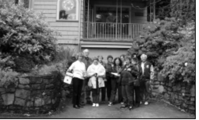
Large Rhododendron in Frank Spinger's front yard.