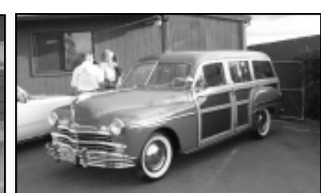
Bill and Dolores Call's 49 P-18 Woody Station Wagon, looking sharp!