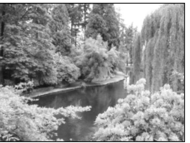
View of Crystal Springs Rhododendron Gardens

The next Mayflower tour is scheduled for June 10, 2004 and will be to Ferguson's Fragrant Nursery between Donald and St. Paul and to the Heirloom Rose Gardens also in the